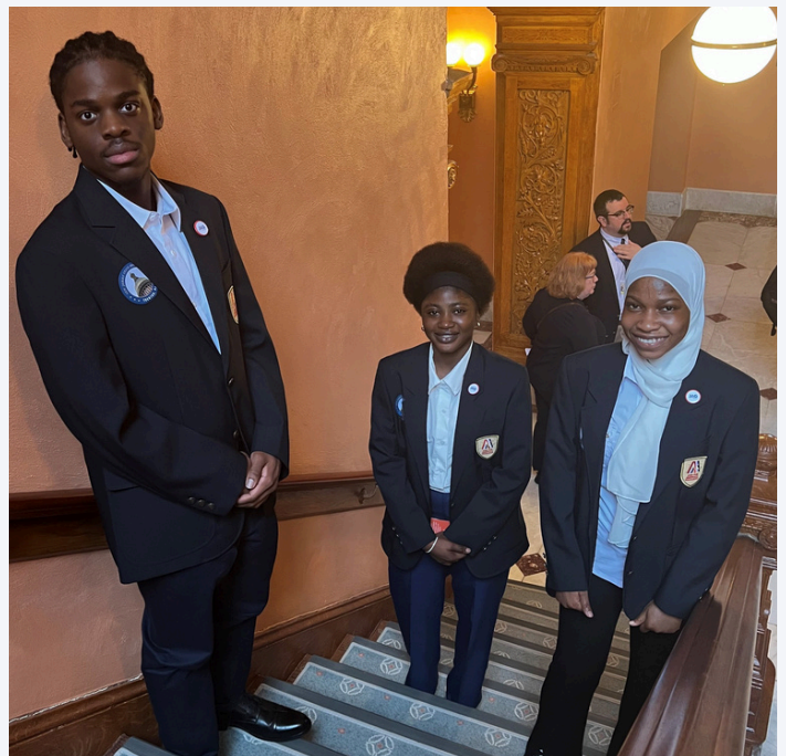
JAG NJ Leaders from Weequahic High School waiting to meet with the legislators