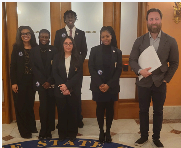
Majority Leader with Rahway High School and JAG NJ State Career Association officers