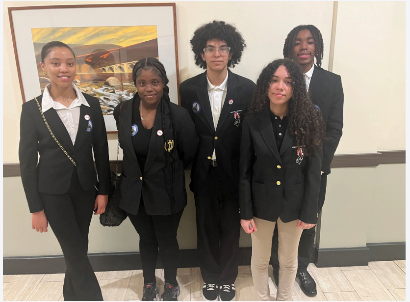
JAG NJ Leaders from Malcolm X Shabazz High School prepared to present the JAG New Jersey program